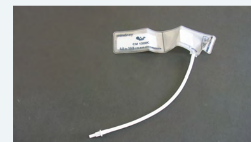
NIBP Disposable use cuff