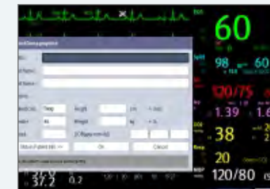
Patient Demographic Menu