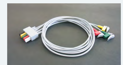
ECG lead set