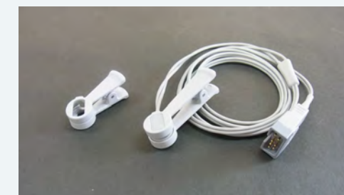
7Pin SPO2 Sensor